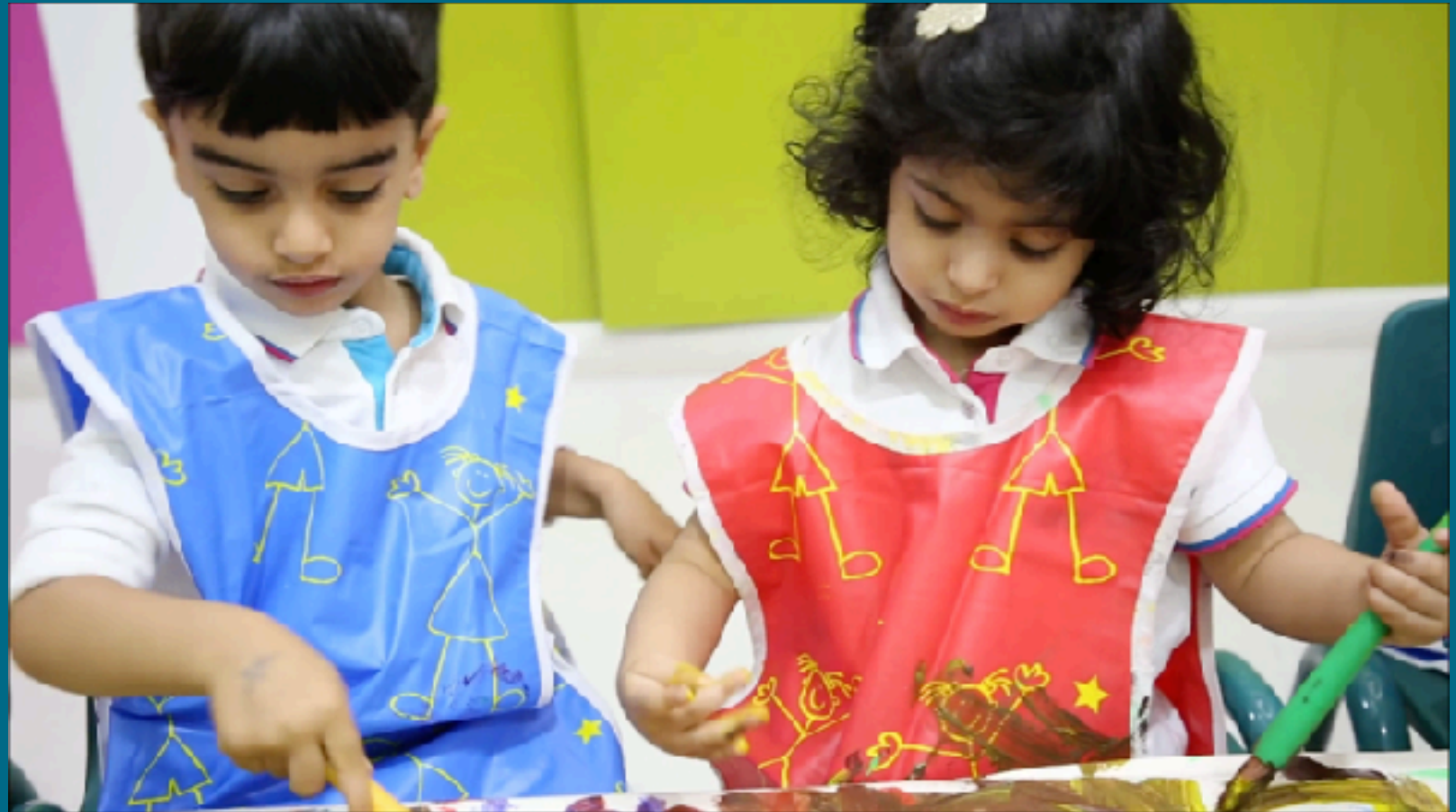
Super Kids - Kuwait

As filming was going so well- we also took the time to film additional footage,