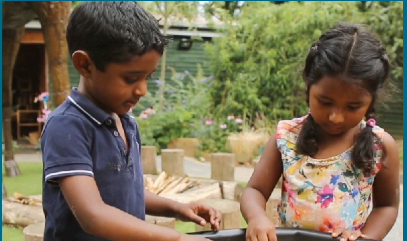
Little Darlings Childcare

This was the main focus of the film; children being independent while socialising with their peers.